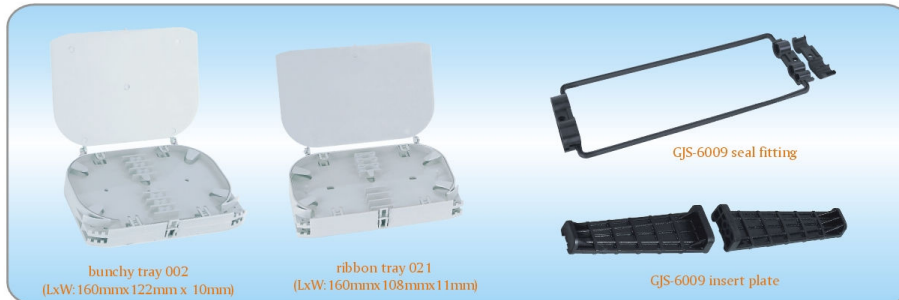
bunched tray 002 (LxW:160mmx122mm x 10mm)