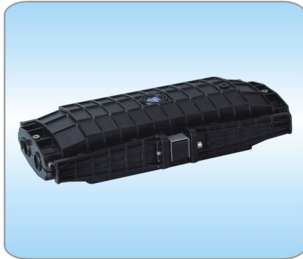
GJS-6009 in full view